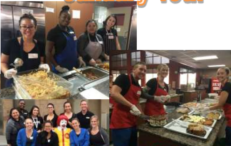
Ronald McDonald House January 19th