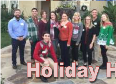
Holiday Home Tour December 3rd