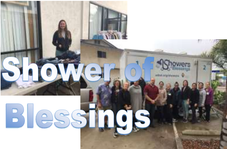
Shower of Blessings