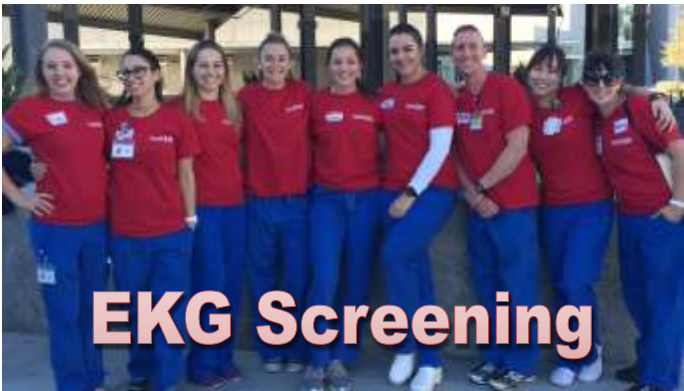
EKG Screening January 28th