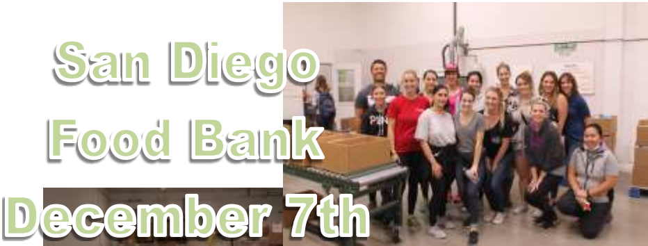
San Diego Food Bank December 7th