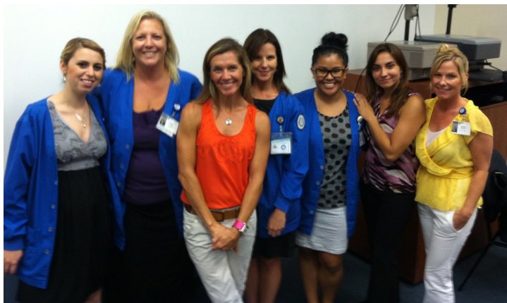
Breaking the ice at Cohort 32's orientation!

Cohort 32 just had their first orientation on September 7 at Spectrum campus. They are full of excitement and great energy! It's going to be an intense few months, but definitely possible. CONGRATS & WELCOME COHORT 32!